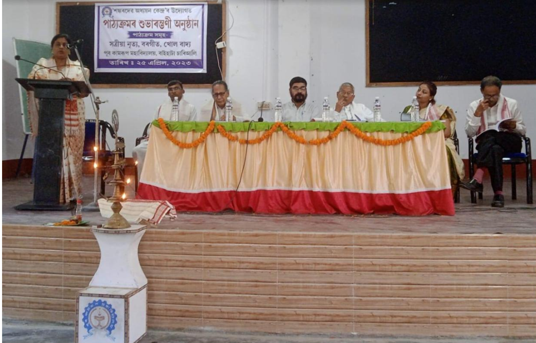
Inauguration of Certificate Courses under Sankardeva Study Centre