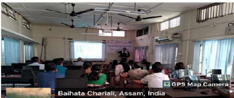
Workshop of Research and development cell