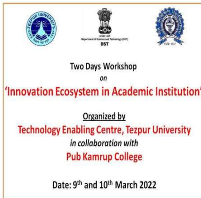
Banner of the workshop