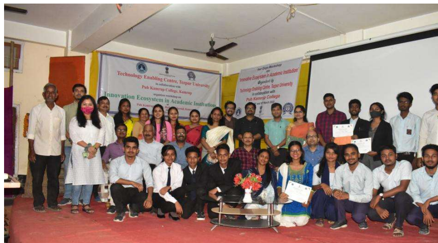
A part of the Team