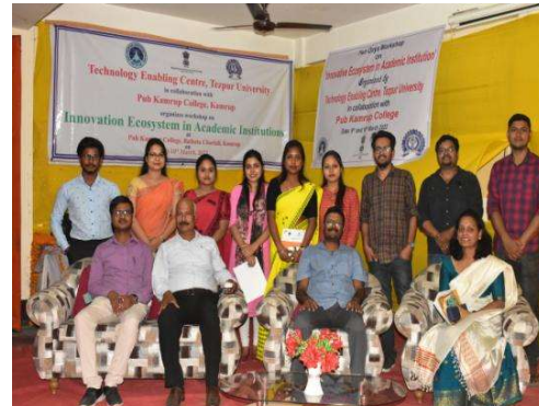
Group photo with the volunteers