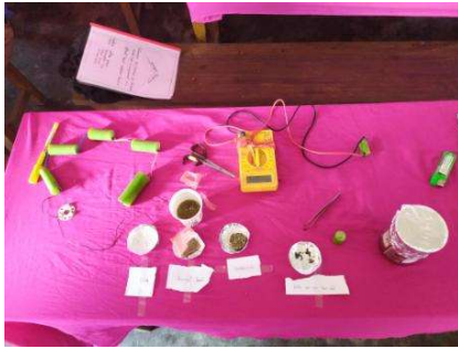
1 st prize idea