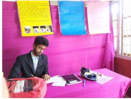
2 nd prize idea