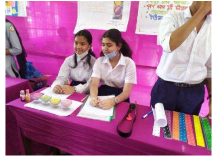
3 rd prize idea