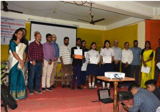
Group photo with the four best idea presenters